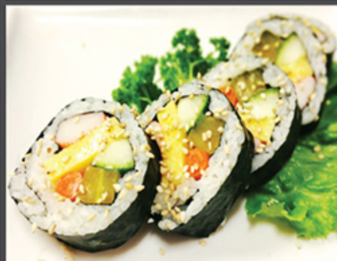
Futo Maki $8.95 5 pcs - crab, egg & vegetables