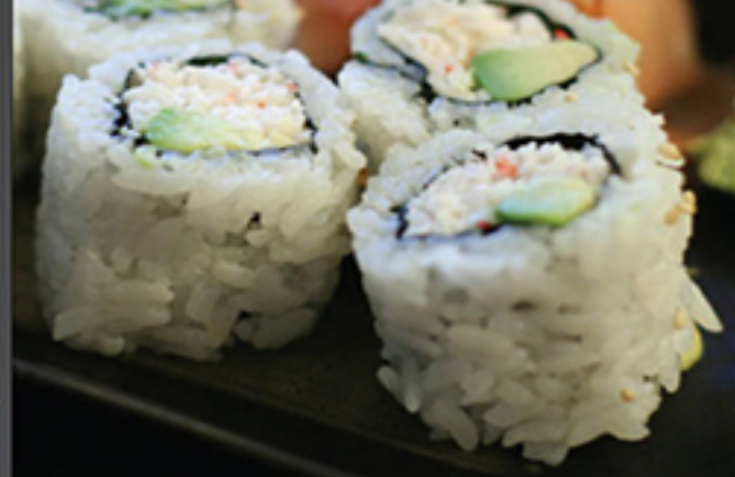
California Roll $5.00 6 pcs - avocado & crab