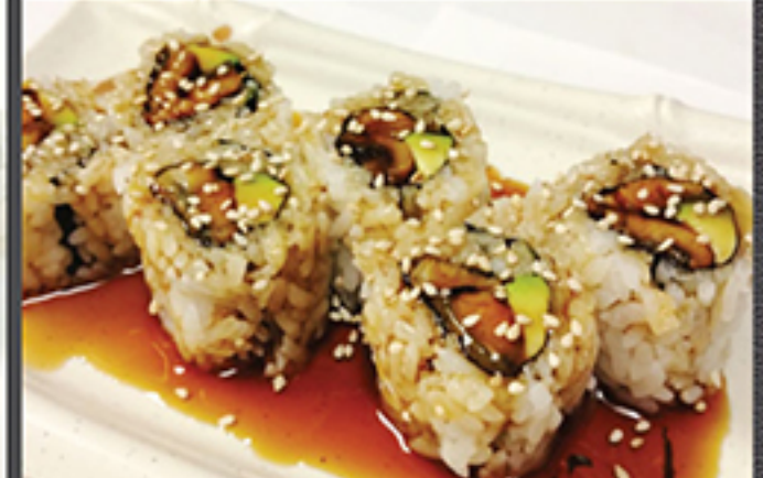
Rock N'Roll $8.95 6 pcs - avocado, unagi, tobiko & chives