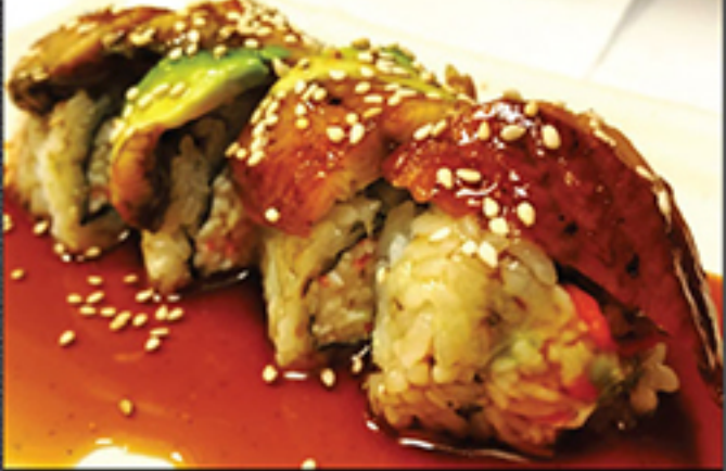
Super Cali Roll $10.95 8 pcs - Crab & avocado w/ unagi, tobiko & chives