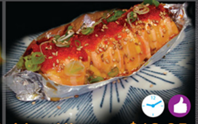
Lion King $12.95 8 pcs - california roll topped w/ baked salmon, masago, chives