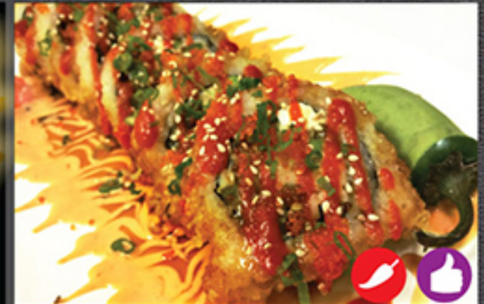
Jalapeno Roll $11.45 6 pcs - jalapeno, crab, avocado, cream cheese, w/ tobiko, chives