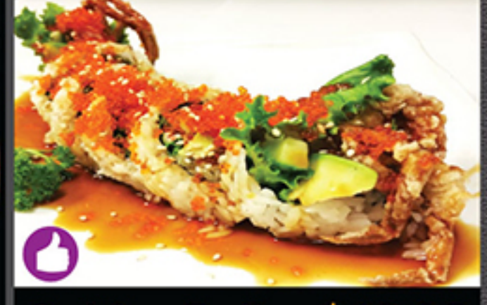
Spider Roll $12.95 6 pcs - crab, deep fried soft shell crab, tobiko, vegetables & unagi sauce