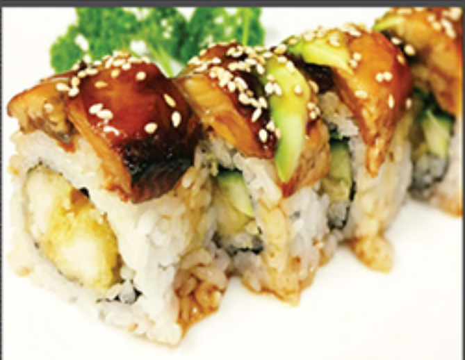
Dragon Roll $12.95 8 pcs - shrimp tempura & crab w/ unagi & avocado