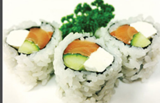
Philly Roll $8.95 6 pcs - smoked salmon, cream cheese & cucumber