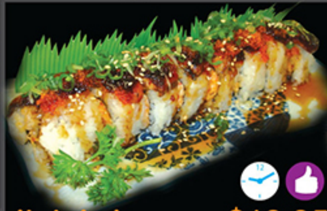
Jinie's Lamp $13.95 8 pcs - shrimp, avocado, crab roll w/ eel, masago, chives