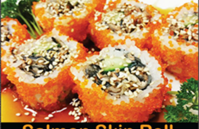
Salmon Skin Roll $8.95 6 pcs - grilled salmon skin, tobiko & chives