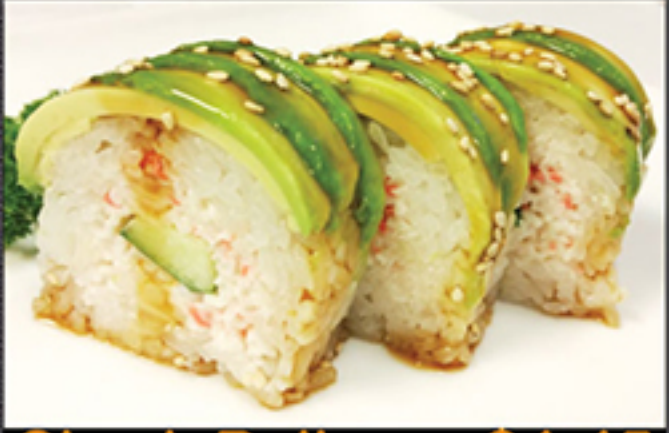
Shrek Roll $4.45 3 pcs - crab, cucumber roll topped w/ avocado & unagi sauce