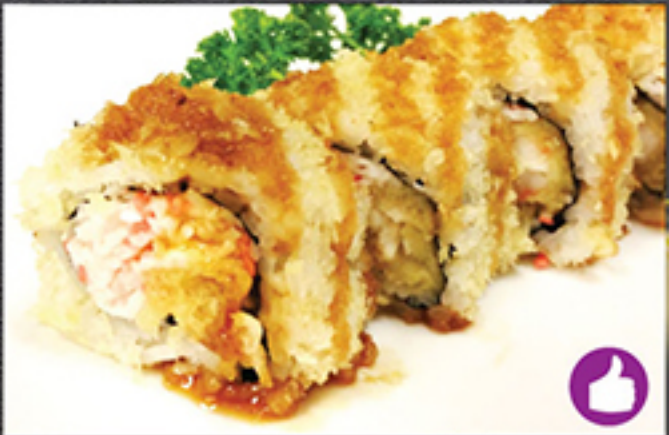
Crunch Roll $10.95 8 pcs - shrimp tempura & crab roll w/ crunch powder & our special sweet sauce