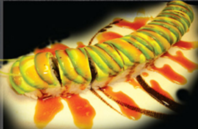
Caterpillar Roll $11.95 8 pcs - unagi topped w/ slices of avocado drizzled w/ unagi sauce