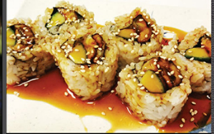
Unakyu Maki $8.95 6 pcs - cucumber, unagi, tobiko & chives