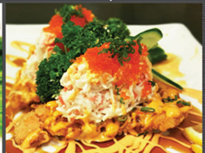
Sharks Special $6.95 2 pcs - crab, tobiko, chives fried fish in panko