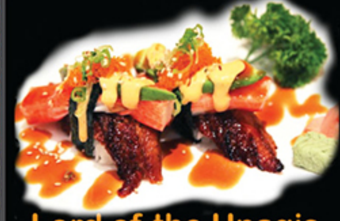
Lord of the Unagis $7.95 2 pcs - nigiri style w/ unagi, avocado, crab & tobiko