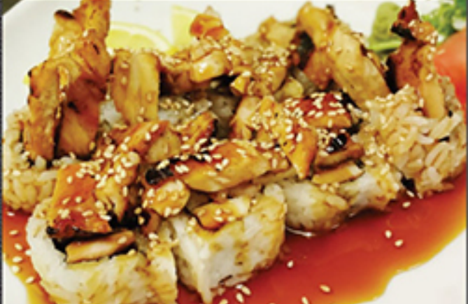
Chicken Teri Roll $9.50 8 pcs - Chicken Teriyaki