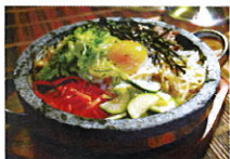
2. Bulgogi Dolsot